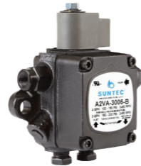
A-3000 SOLENOID SINGLE-STAGE