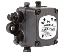
A1RA & A2RA SINGLE-STAGE