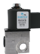
R & C SHUT-OFF VALVES