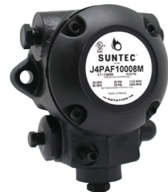
J MEDIUM CAPACITY