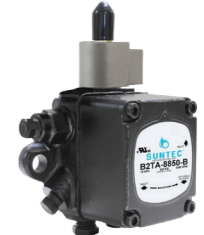
B-8800 SOLENOID TWO-STAGE, TWO-STEP