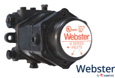
V HIGH CAPACITY