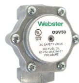
OSV OIL SAFETY VALVES