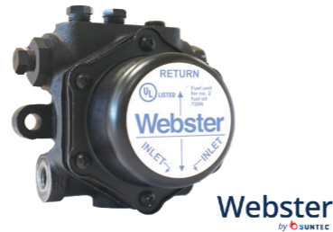
R MEDIUM CAPACITY