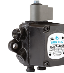
B-4000 SOLENOID TWO-STAGE